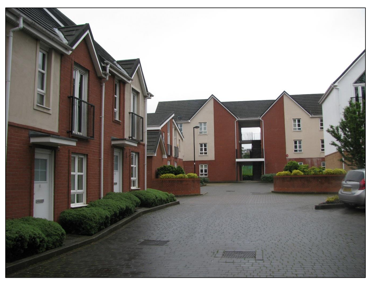
High quality residential development within Stapenhill