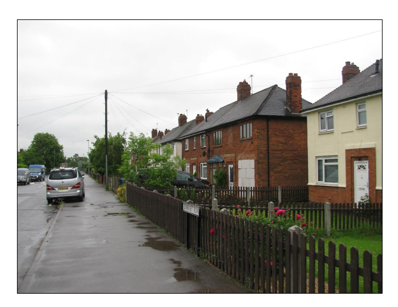
Typical residential street in the parish