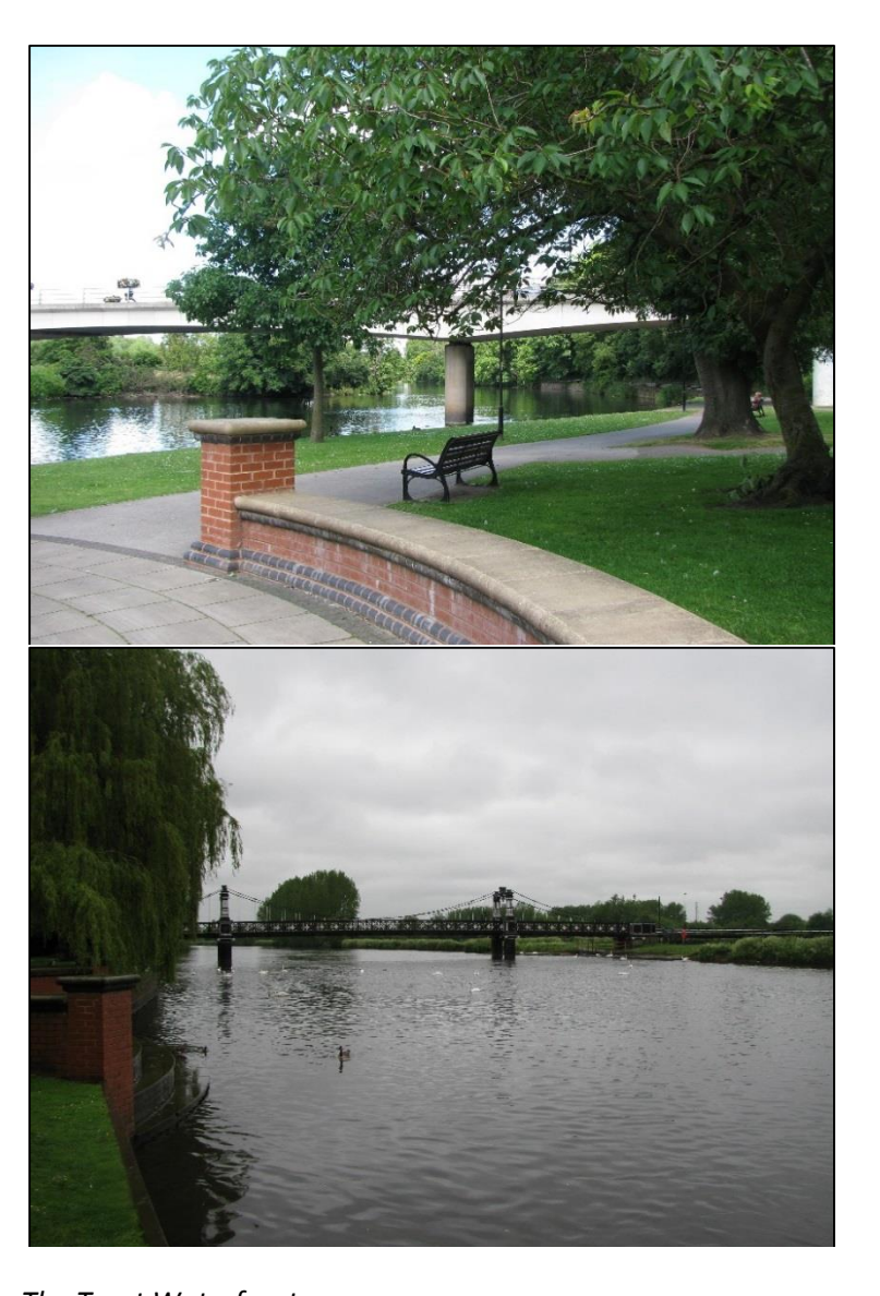
The Trent Waterfront

Development proposals adjacent to the waterfront that contribute to the improvement of the public realm, specifically improving the cycle and pedestrian access to the waterfront, will also be looked upon favourably.