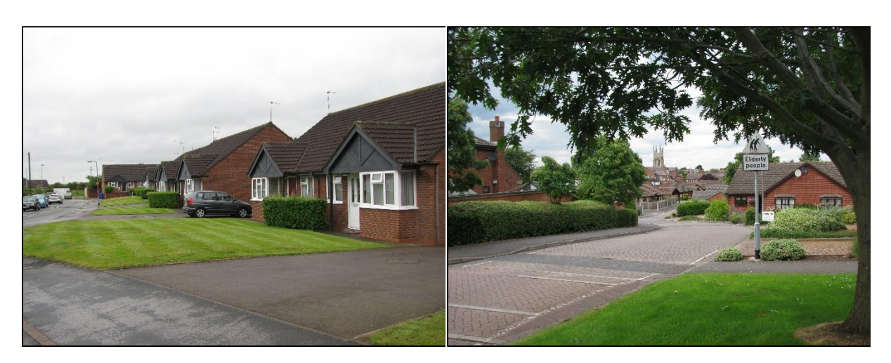
Bungalows within the parish