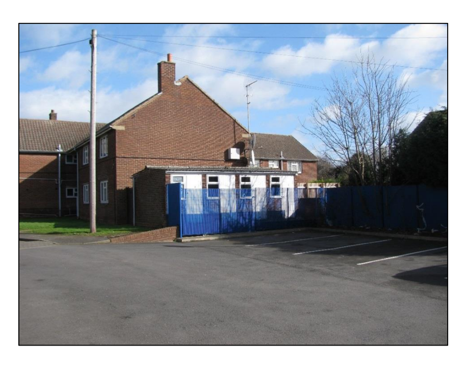
Parking in the parish