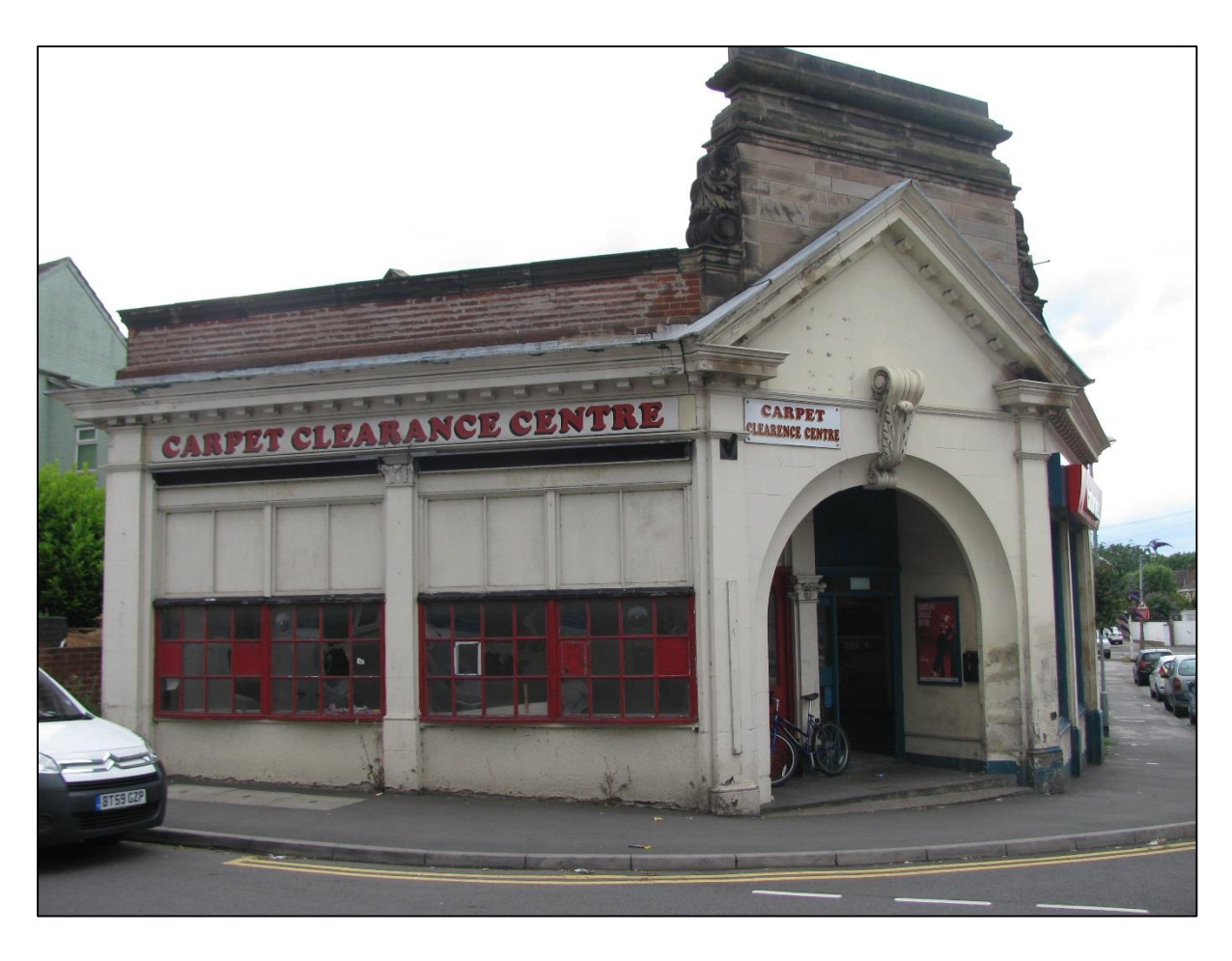
Vacant Cartpet Clearance Centre

The neighbourhood plan supports proposals which seek to bring back into active use previously developed land or buildings subject to compliance with all other development plan policies. In particular, it supports schemes which incorporate the sympathetic reuse of buildings and are informed by the historic character of these buildings. Where appropriate, applications for the conversion of the ground floor existing retail and commercial premises to residential dwellings will be resisted unless it can be demonstrated that the premises is no longer required and / or that there is no other viable use, following the active marketing of the property for a minimum of 6 months.