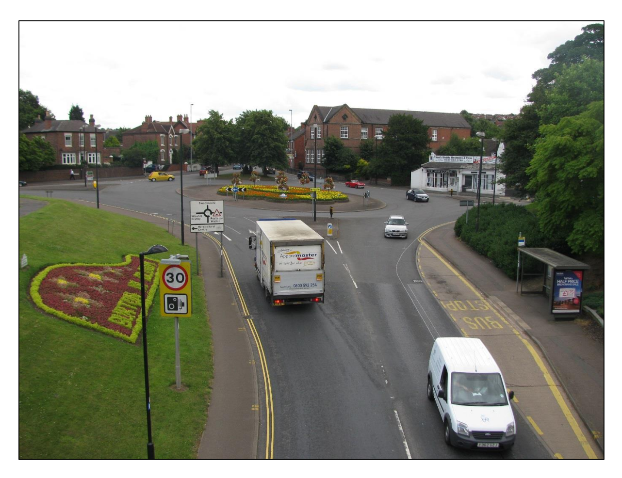
View towards St Peter's Street