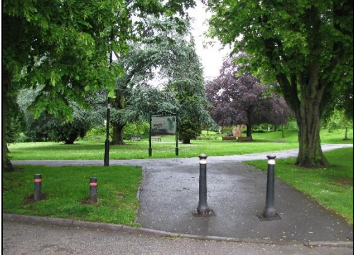
Pedestrian routes in the parish