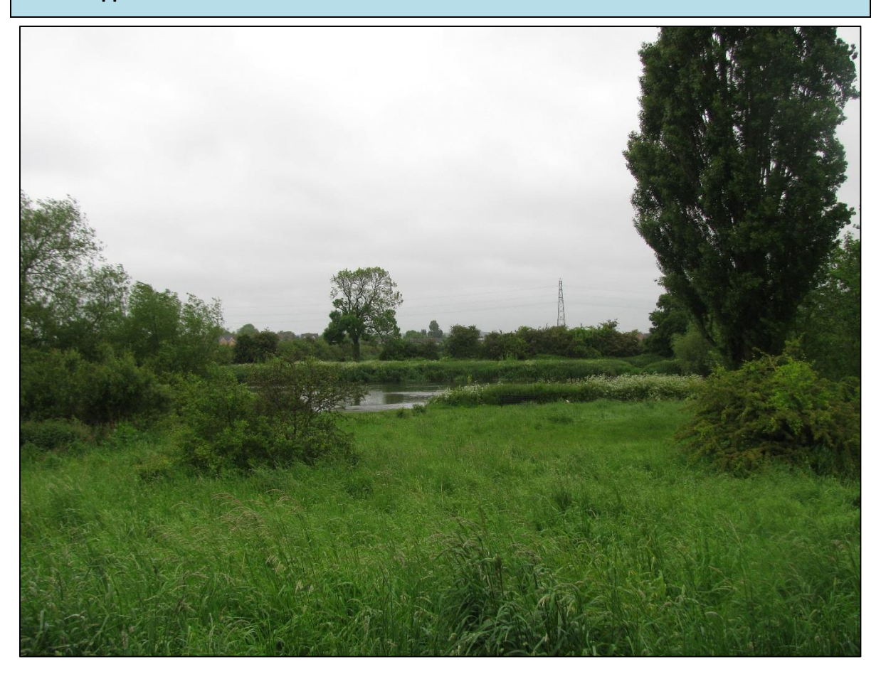
Valuable biodiversity sites

Larger applications must demonstrate how they have responded to the wider green infrastructure network (as set out in the proposals map) as part of their submissions, through the use of either a Design and Access Statement or in the case of smaller schemes, within their site layout plans. Schemes that do not take opportunities that are available from the site - regardless of scale - will not be supported.