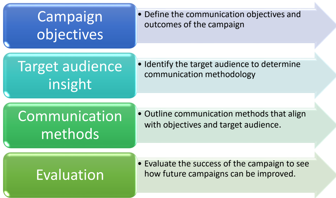
Figure 4: Campaign Model

By adopting a communication model the Council is able to plan its communication which enables devolved ownership of key messages, objectives and evaluation.