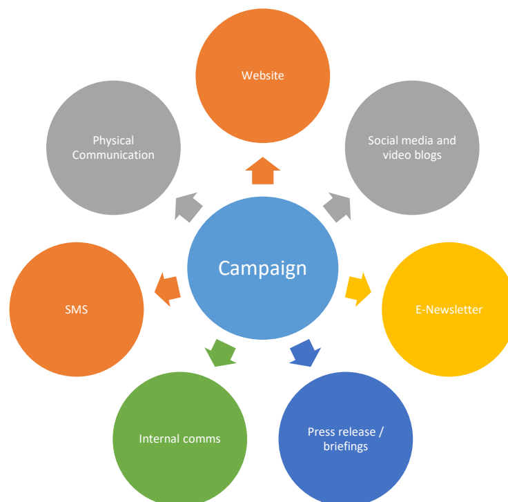
Figure 6: Communications Plan

Relevant initiatives identified in the communications plan will be supported using the communications campaign model utilising multi-faceted methods of communication as shown below.