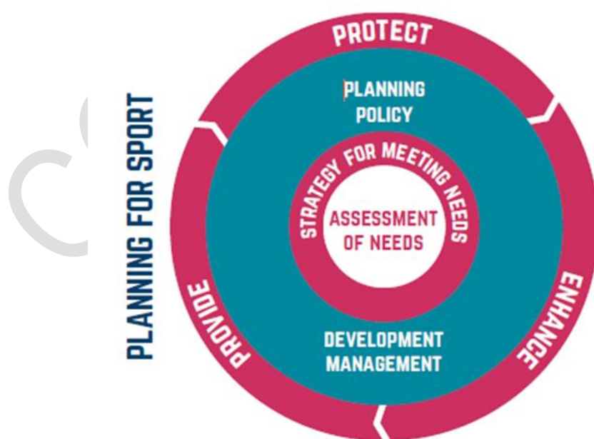
Figure 2.1: Sport England themes