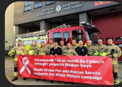
Fire & Rescue