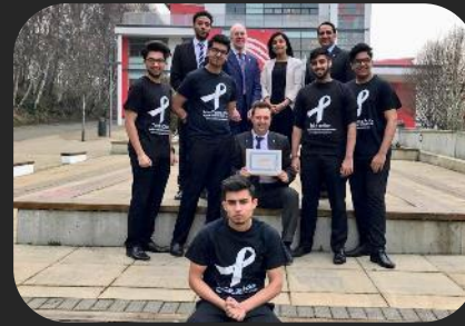
College / University

Smaller organisations can become White Ribbon Supporters. You can promote this in their area.