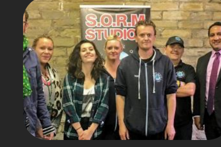
Venue / Festival