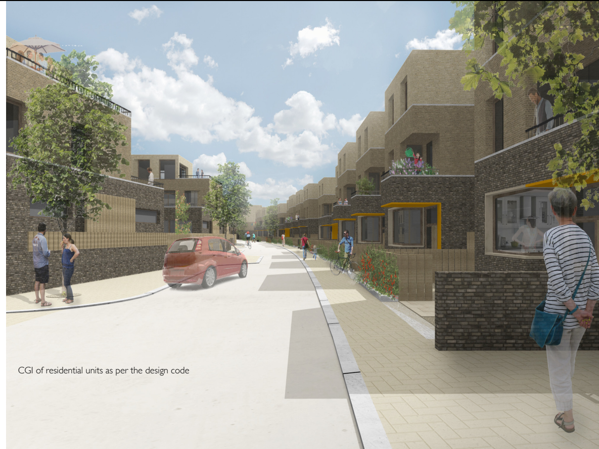
CGI of residential units as per the design code