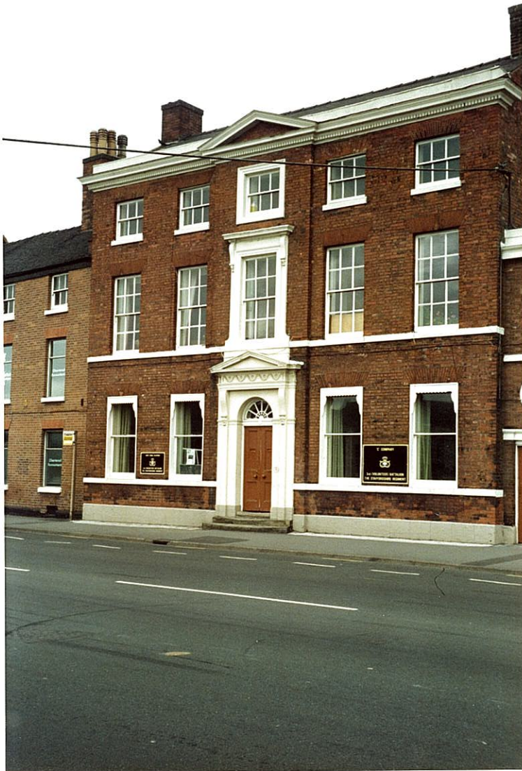
167 Horninglow Street

The Magistrates Court was built in 1909-10 by Henry Beck in English Baroque style. It is of ashlar with a 2 storeyed centre-piece. It is flanked by Ionic columns with an elaborately carved parapet surmounted by a flamboyant leaded drum and cupola.