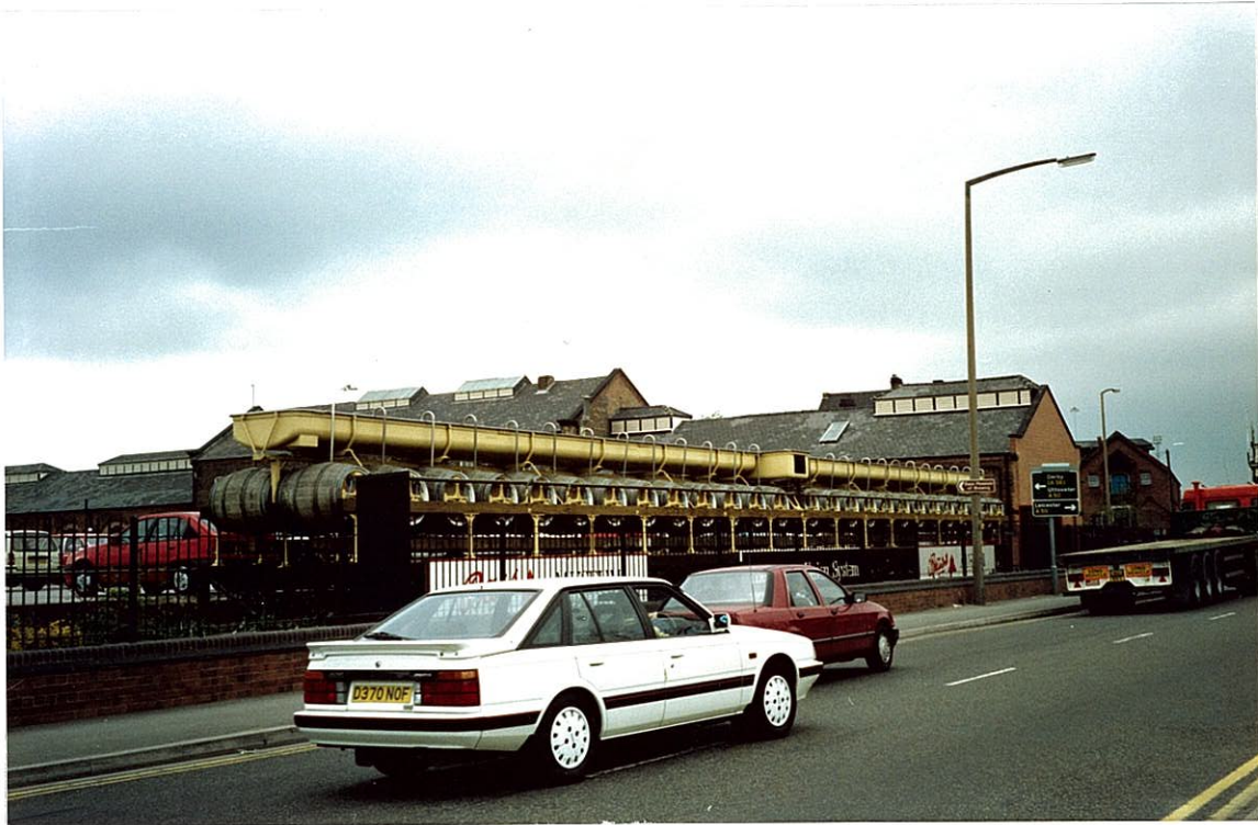
The Union System, Guild Street